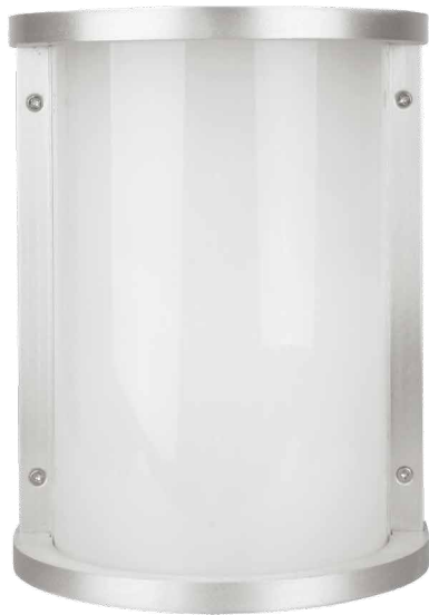
Integrated LED Fixture

An excellent choice for outdoor illumination, this Euri Lighting wall light is offered in neutral Soft White (3000K) to create an inviting atmosphere within any home or office. Everything about this LED wall light, from the cylindrical shape to the brushed nickel housing, creates a contemporary and minimal style. Built to last 50,000 hours, this sleek flush wall light reduces energy and maintenance costs year after year.