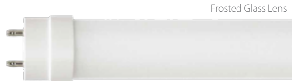
Frosted Glass Lens

LED ET8-3140T-14 delivers superior brightness, valuable energy savings and long lasting performance. EURI 4 ft. Bypass Ballast LED T8 lamps are ideal for offices, conference rooms, hotels, academic complexes, research buildings, medical facilities and commercial stores. Available in 4000K Bright White and 5000K Cool White . Enjoy features such as: instant on, shatter resistant, mercury free.