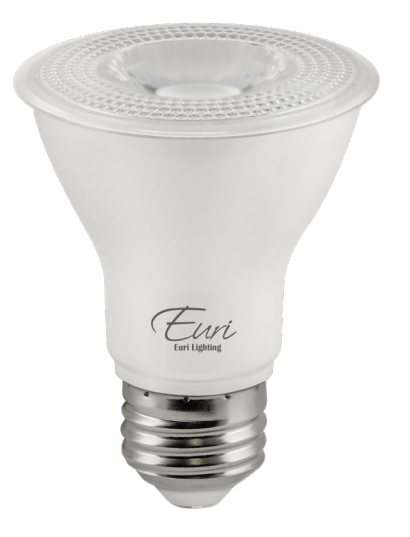
Available only as a twin-pack.