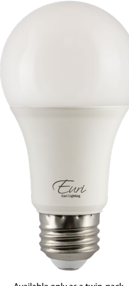
Available only as a twin-pack. (FA19-5W5051cec-2 contains 2 LED Bulbs)