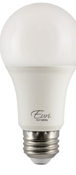
Available only as a twin-pack. (EA19-9W5050cec-2 contains 2 LED Bulbs.)