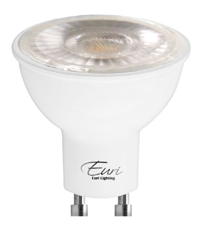
Available only as a twin-pack.