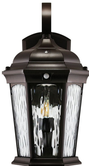
Bronze Finish with Water Glass Lens