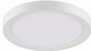
White Aluminum Housing & Frosted Plastic Lens