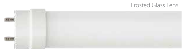
Frosted Glass Lens

LED ET8-3140T-17 delivers superior brightness, valuable energy savings and long lasting performance. EURI 4 ft. Bypass Ballast LED T8 lamps are ideal for offices, conference rooms, hotels, academic complexes, research buildings, medical facilities and commercial stores. Available in 4000K Bright White and 5000K Cool White . Enjoy features such as: instant on, shatter resistant, mercury free.