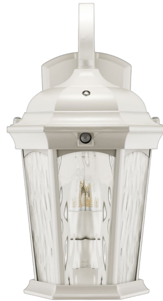
Integrated LED Fixture

*Note: Design, features and specifications subject to change without notice. Some features may not be available on all models. For more information please visit: www.eurilighting.com or call 1-888-743-5766